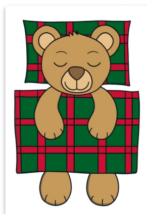
Teddy Tartan Option

We look forward to seeing the vibrant designs the children come up with!