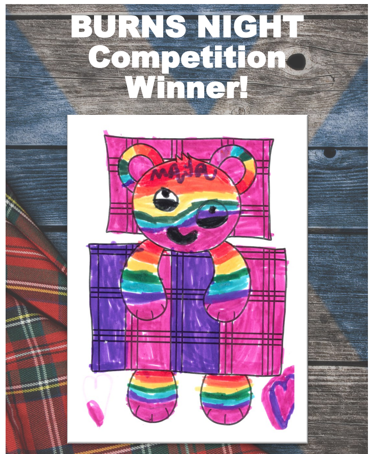
VIEW THE COMPETITION ENTRIES AND OUR WINNER— MAYA IN PEARL CLASS.